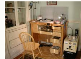
jeweler's bench; learn the processes to create the jewelry you most want to see or wear in the world...

basic, intermediate, & advanced courses. open studio space available for advanced students.