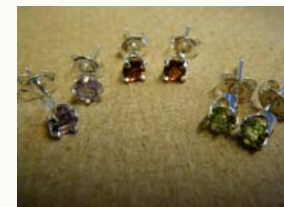
faceted earrings: amethyst, garnet, peridot.

material kits include basic choices from an assortment of stones; requesting personal favorites is also absolutely encouraged!