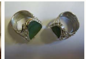
sterling silver rings: this student cut & shaped the stones as well as designed & created the ring bands.