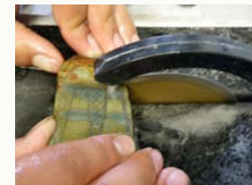
shape the rocks to fit the ideas, measure, carve, cut.

bringing your own chunks of rock is fun & encouraged!!! making requests for particular kinds of stone is also fun & encouraged!!!