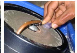
shape, smooth, polish, refine.